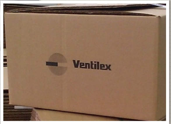
NEW DEDICATED SECURE INVENTORY STOCK AREA IN MIDDLETOWN, OH