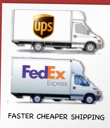
FASTER CHEAPER SHIPPING